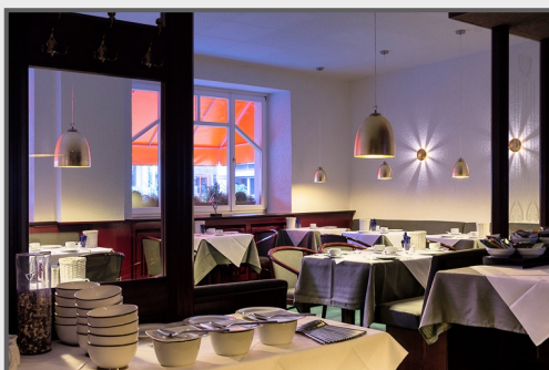
Our breakfast room